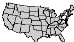
Mid-Atlantic Water Resource Region 02 HUC6 Level Watersheds