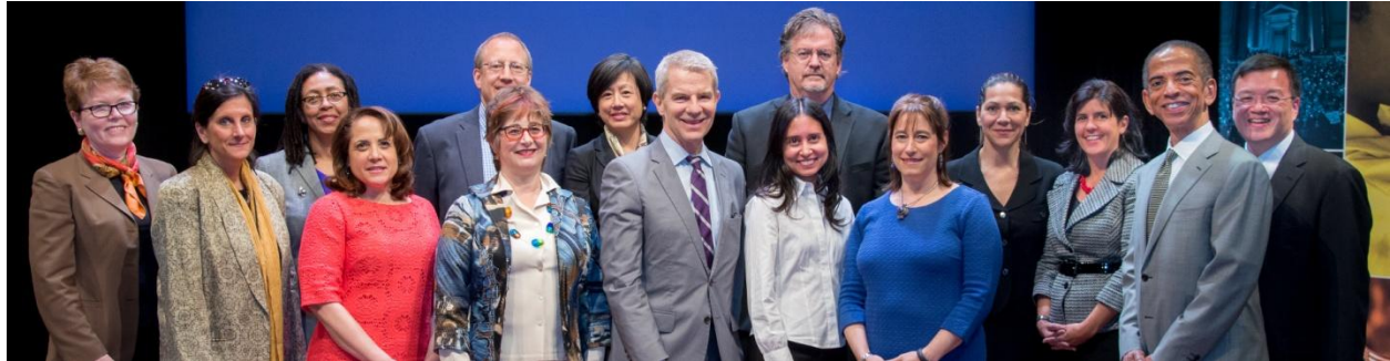
taken at PNY Annual Meeting 2013