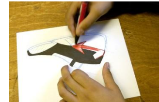
Nike shoe design