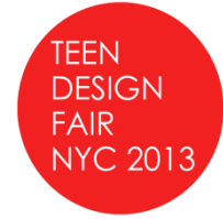
Teen Design Fair