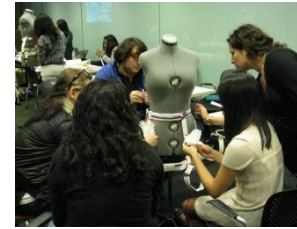
Sewing and draping