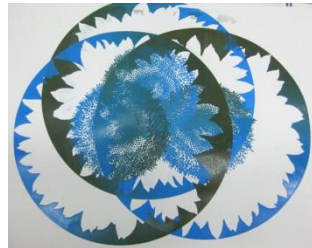
Screen printing workshop